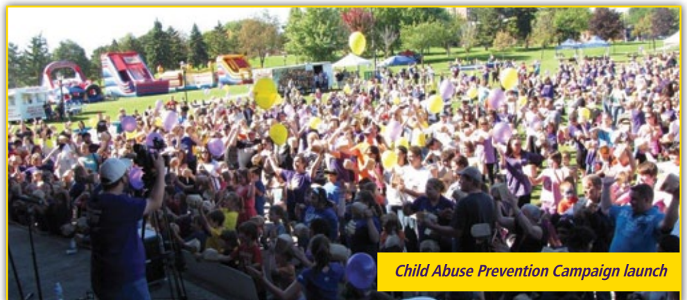
Child Abuse Prevention Campaign launch

This past year has been a very busy one with many events to speak of, but the Child Abuse Prevention campaign is the most noteworthy. Many events were organized throughout the month of October to raise awareness, and the community presence at each was over-whelming. Time and again, people united in record numbers to “ Break the Silence ” on child abuse and neglect. In fact, our community action inspired 9 other child protection agencies and their communities across Eastern Ontario to unite with us on Community Dress Purple day to show support on the importance of protecting and keeping our children and youth safe. We did it SD&G, the message “ Break the Silence, Use Your Voice ” was heard loud and clear!