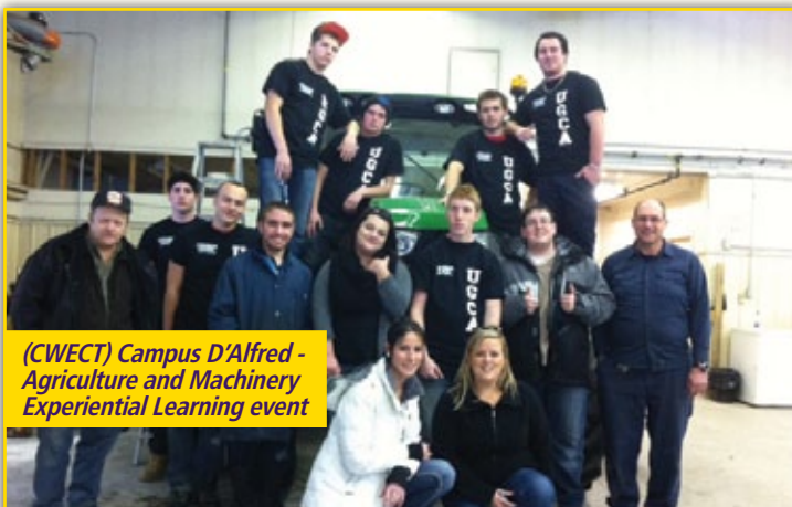
(CWECT) Campus D'Alfred - Agriculture and Machinery Experiential Learning event