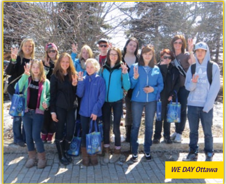
WE DAY Ottawa

For a while now, our youth room and youth website have been under construction and we are proud to announce that our youth website and youth room are ready to be launched this summer. We look forward to you checking it out and sharing your talents with all of us. Stay tuned for many new youth leadership initiatives this coming year.