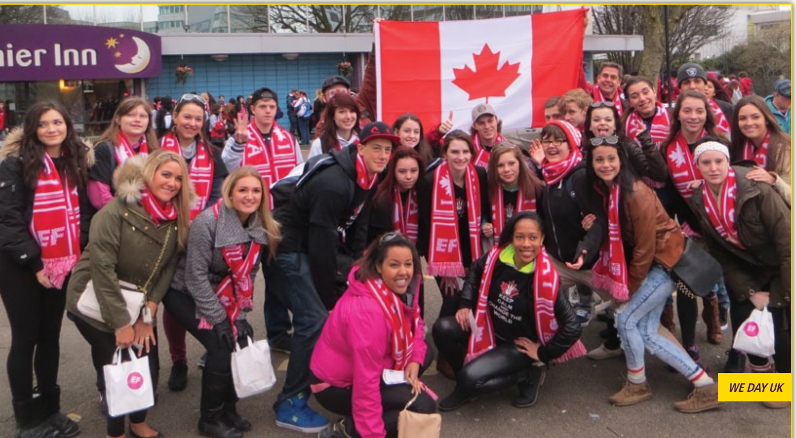
WE DAY UK